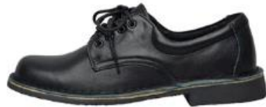
Darcy Lace-Up Shoes $75.00 AUD