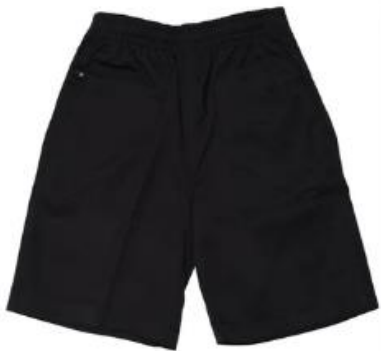
Gaberdine Shorts - Black $25.00 AUD