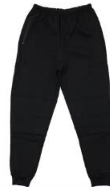
Cuffed Track Pants - Black $26.00 AUD