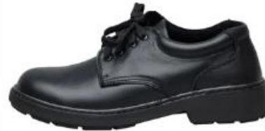
Harper Lace-Up Shoes $75.00 AUD