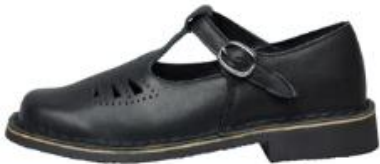
T-Bar Shoes $75.00 AUD