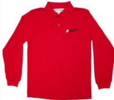
Chelsea Heights PS Long Sleeve Polo $28.00 AUD