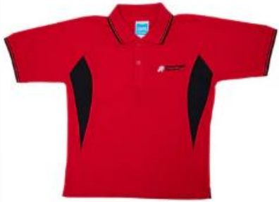
Chelsea Heights PS Short Sleeve Polo $29.00 AUD