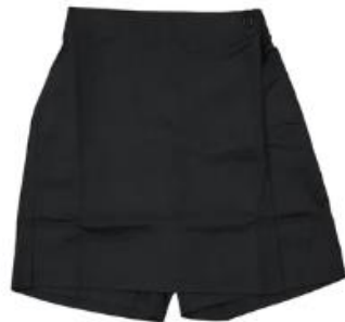
Skort - Black $25.00 AUD