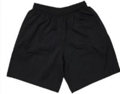
Rugby Shorts - Black $19.00 AUD