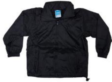
Rain Jacket - Black $36.00 AUD