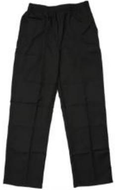
Gaberdine Pants - Black $29.00 AUD