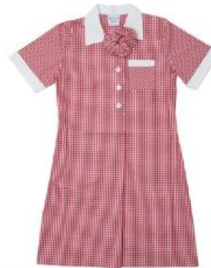
Gingham Summer Dress - Red $29.00 AUD