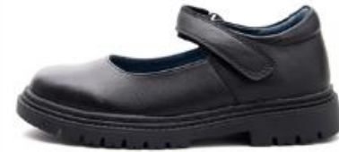
Mary Jane Shoes $65.00 AUD