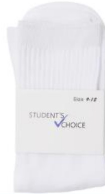
Ankle Length Socks - White $4.00 AUD