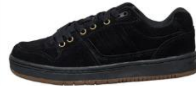
Skate Sneakers $55.00 AUD