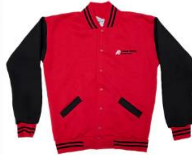
Chelsea Heights PS Bomber Jacket $40.00 AUD